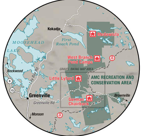
Little Lyford Ponds Area

True North Magnetic North Declination 17-1/2° West August 2022